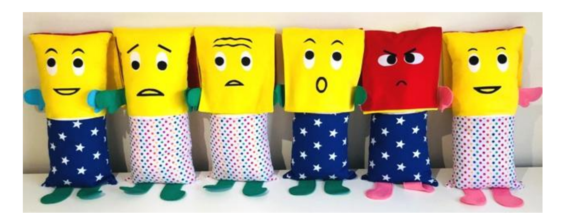
4 Cathy in Kent