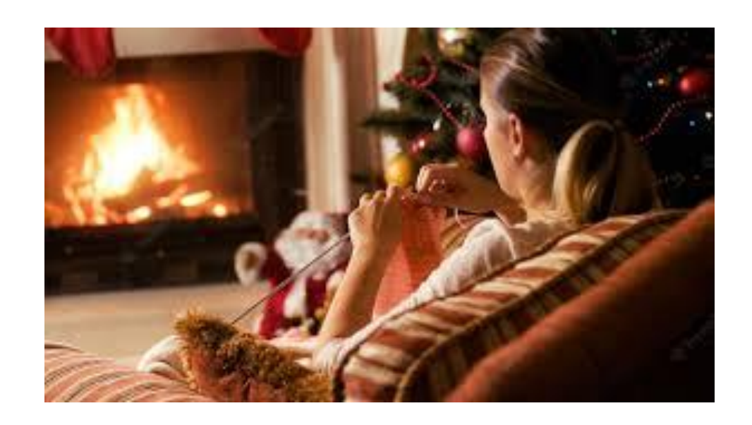
KfN wishes you a very Happy and Peaceful Christmas and we look forward to more of your amazing creations in 2023!