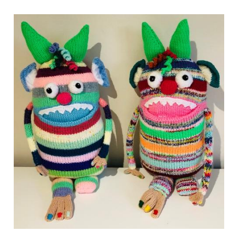
120 Katharine in Warwickshire