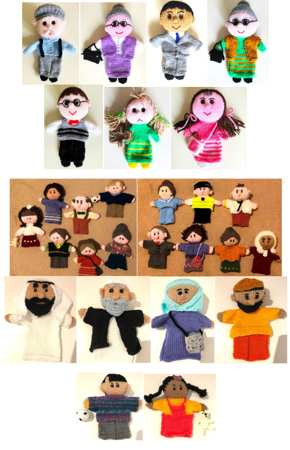
Please note that girl and boy puppets need to fit an adult's hand