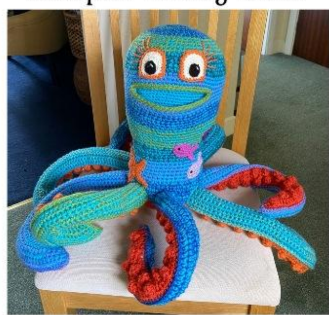
with Toothy & Doodle (for scale)