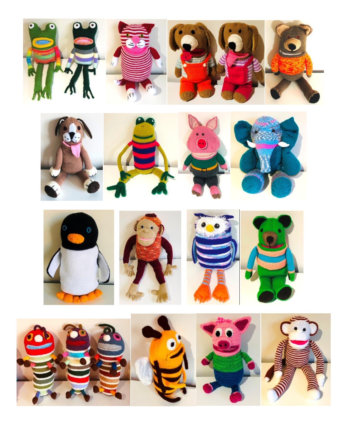
If a picture of your item hasn't appeared this time it's not deliberate, just a question of space available, so if you'd like to see one of your items in the Newsletter please let Clare know and it can be included next time.