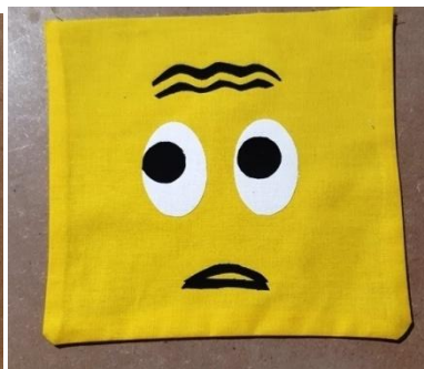
ANGRY – note the eyebrows