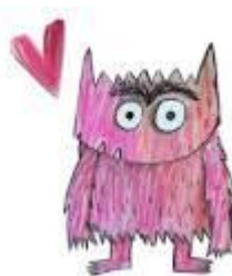
Tenderness and Fear